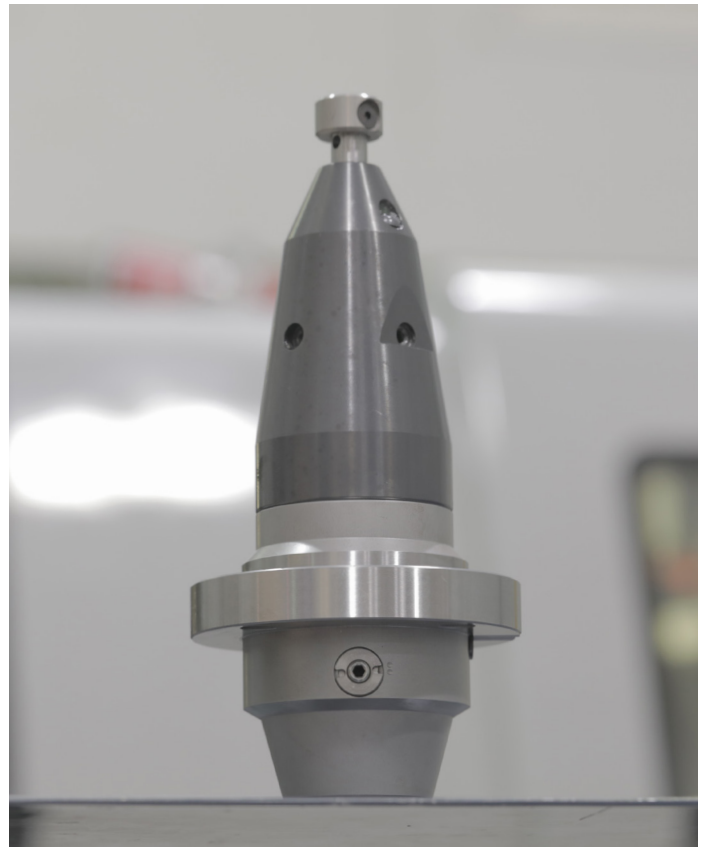
Image: shows the pusher at the rear of the W20 Premierplus which contains the hydraulic intensifier inside the body of the adaptor

The Premierplus Adaptor range is available in W20, W25 and B32/45 sizes in Precision Collet Assembly (PCA) versions only. The Premierplus PCA version is designed to further control tool runout as it enables operators to radially adjust the collet via adjustment screws.